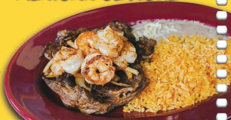
STEAK & SHRIMP