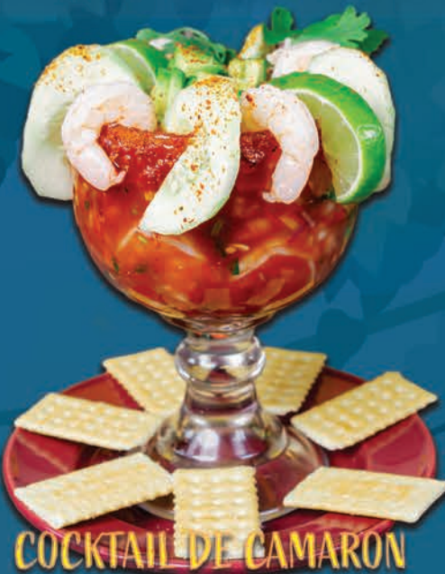
COCKTAIL DE CAMARON

Our delicious shrimp cooked with onions and bell peppers. Served on a bed of lettuce, with fresh tomatoes, slices of avocado, cucumber, and topped with melted cheese. 11.99