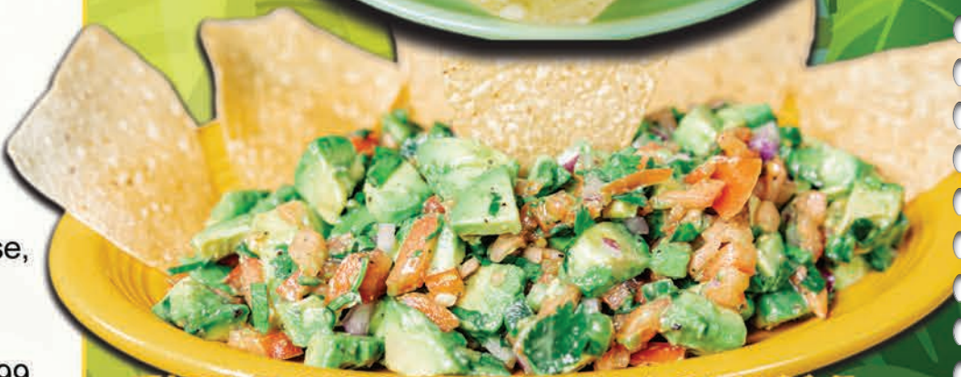
TABLE SIDE FRESH GUACAMOLE