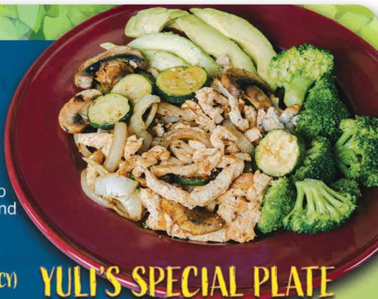
YULI'S SPECIAL PLATE

Your choice of grilled chicken or steak. Served on a bed of rice with cheese sauce. 11.99 Mixed 13.99