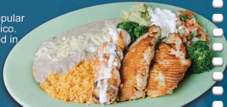
TILAPIA AL CARBON