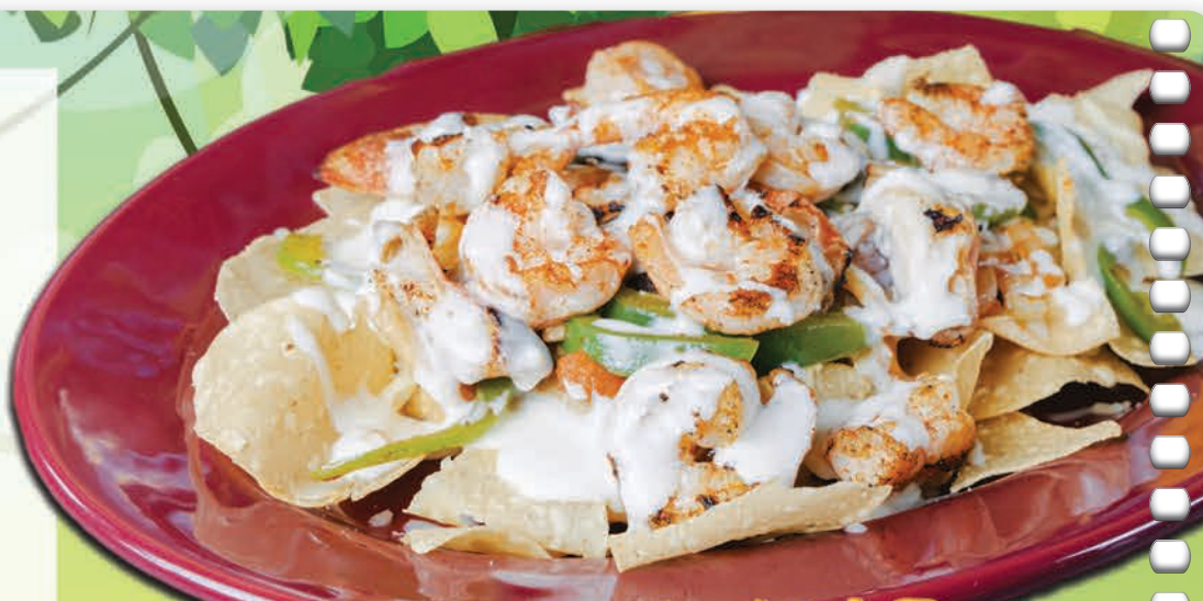
NACHOS DEL MAR

Cheese nachos with assorted fresh toppings: ground beef, seasoned chicken, and refried beans. Covered with lettuce, sour cream, tomatoes then smothered in cheese sauce. 12.99