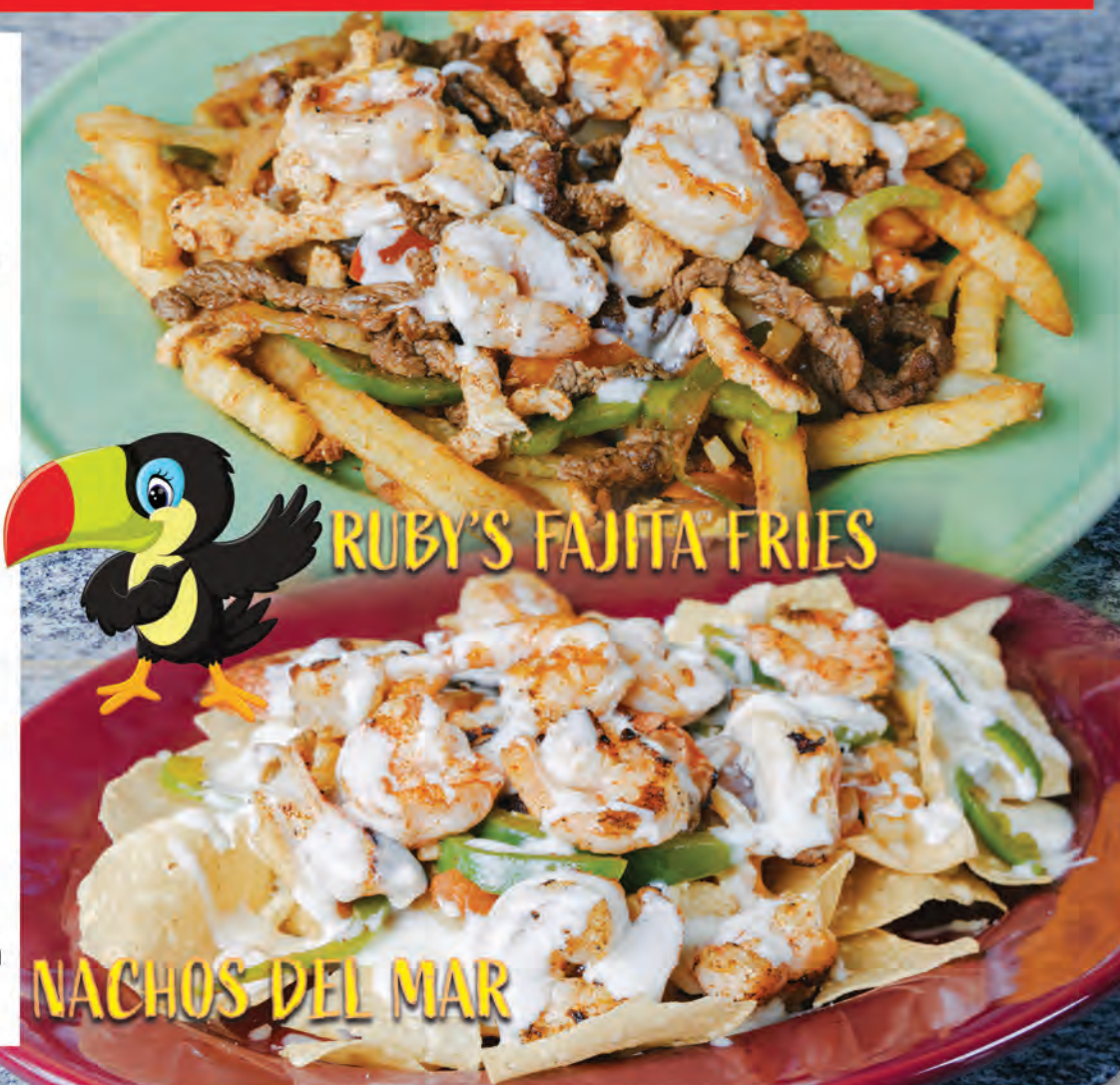
RUBY'S FAJITA FRIES

Cheese nachos with assorted fresh toppings: ground beef, seasoned chicken and refried beans. Covered with lettuce, sour cream, tomatoes then smothered in cheese sauce. 10.49