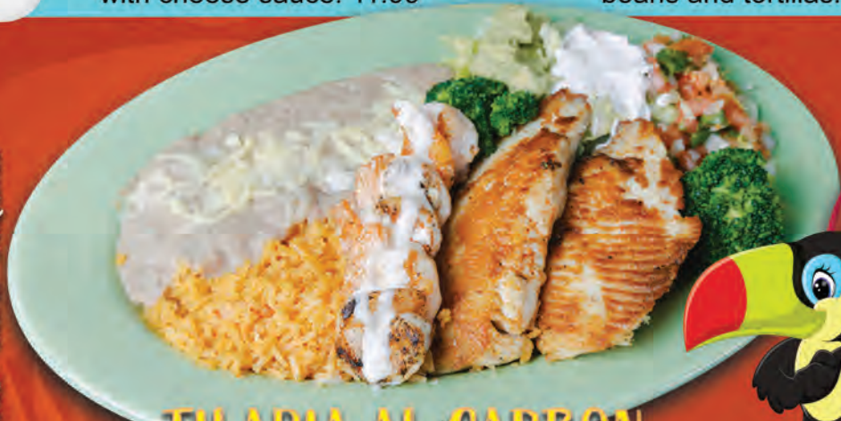
TILAPIA AL CARBON