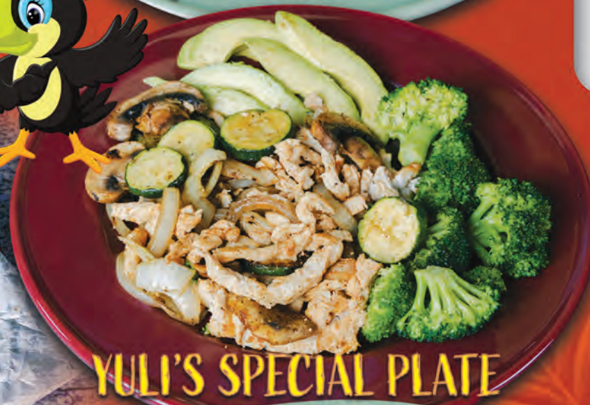
YULI'S SPECIAL PLATE