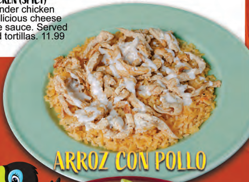
ARROZ CON POLLO

Your choice of grilled chicken or steak. Served on a bed of rice with cheese sauce. 10.99 Mixed 11.99